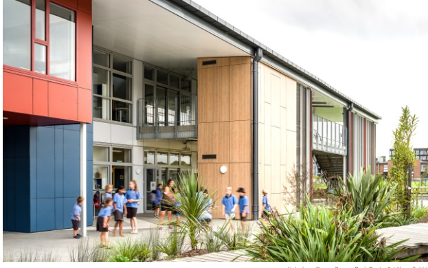
Unicolour: Sienna Brown, Dark Denim & Milano Sabbia

The phenolic panels endure 3,000 hours of artificial aging which is equivalent to 10 years of real-time weathering!