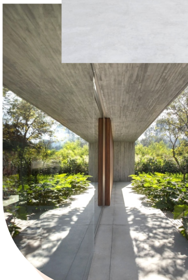
Wood Decor: Halmstad

TRESPA installation functions as a ventilated façade system, which aids in insulation. The air cavity formed due to the TRESPA panels and the outer wall provides continuous airflow, mitigating heat and moisture.