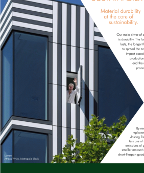
Lamerc: Athena White, Metropolis Black

Our main driver of sustainability is durability. The longer the product lasts, the longer the period of time to spread the environmental impact associated with the production of raw materials and the manufacturing process.