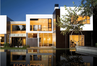
Metallix: Titanium Bronze

EACH ACTION, YOUR REFLECTION, FOR YOUR FUTURE GENERATION.