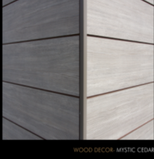
WOOD DECOR- MYSTIC CEDAR