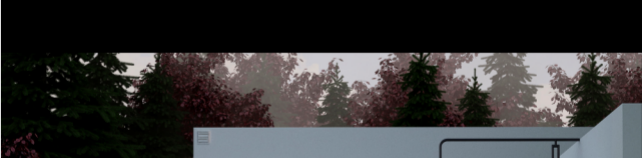
WOOD DECOR- HESBANIA