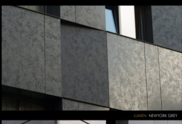
LUMEN- NEWYORK GREY