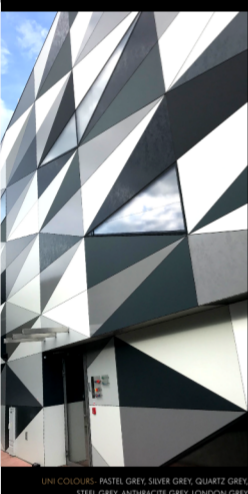
UNI COLOURS- PASTEL GREY, SILVER GREY, QUARTZ GREY, STEEL GREY, ANTHRACITE GREY, LONDON GREY

A city is not a static place but a source of inspiration, surprises and experiences.